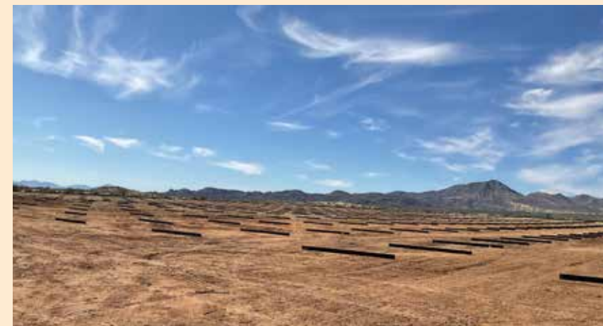
Equipment for the solar panels set out on the ground.