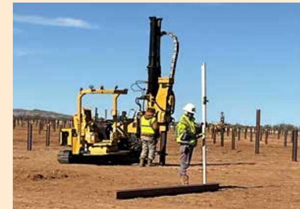
Workers set up poles for the solar panels.