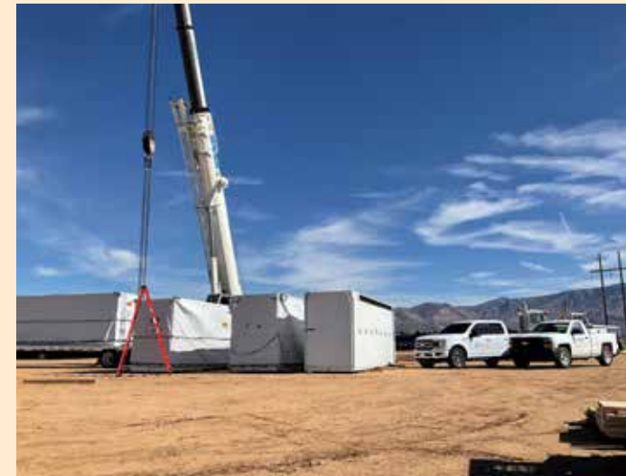
A set of 12 battery packs were delivered to the Chirreon Solar and Battery Storage Facility on January 25, 2022. The battery packs weigh 55,000 pounds each.